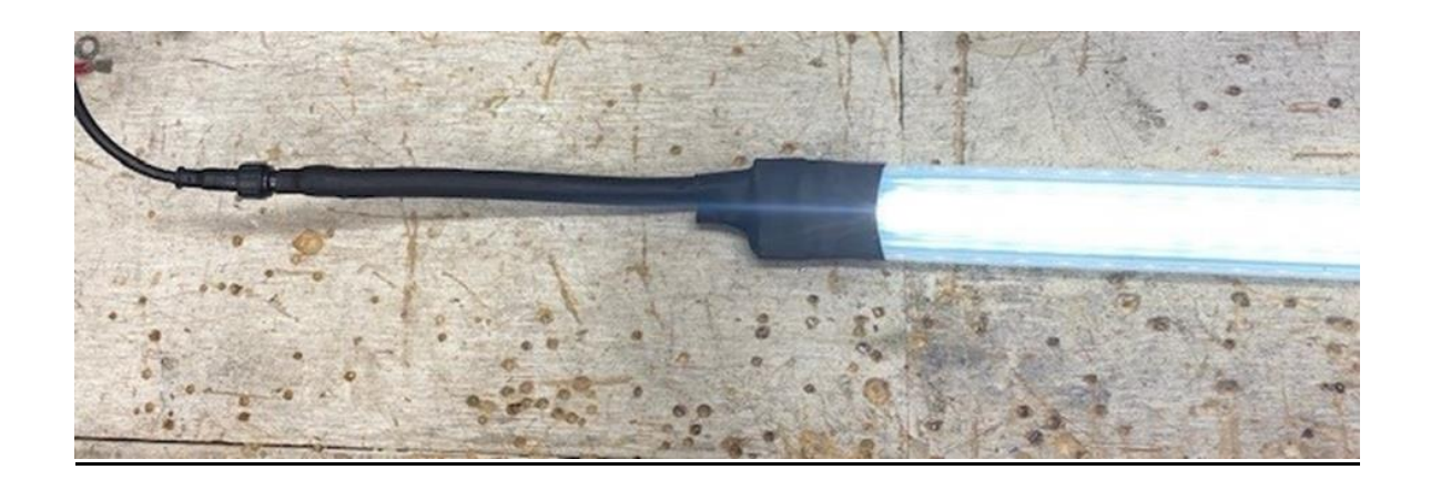
Simple Plug attachment. Supplied with 2m lead. Can be hard wired into power source or plugged if required.